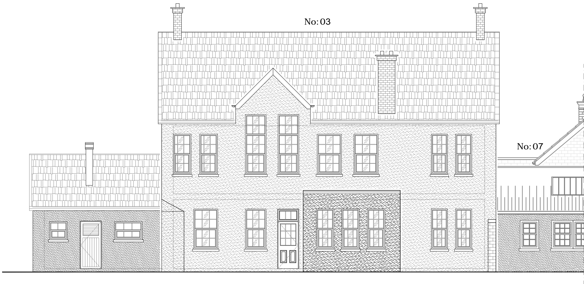
EXISTING FRONT ELEVATION SCALE: 1/100