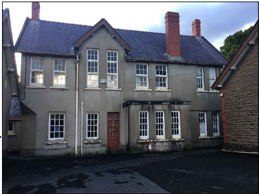
EXISTING FRONT VIEW

THE CONTENTS OF THIS PLAN INCLUDING THE PRINTED NOTES ARE COPYRIGHT AND REPRODUCTION IN WHOLE OR PART IS NOT PERMITTED WITHOUT PRIOR CONSENT OF ANVA ARCHITECTURAL, ENGINEERING AND LICENSING IN WRITING.