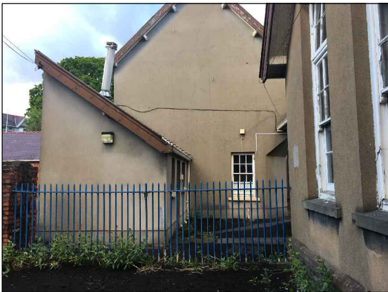
EXISTING SIDE VIEW